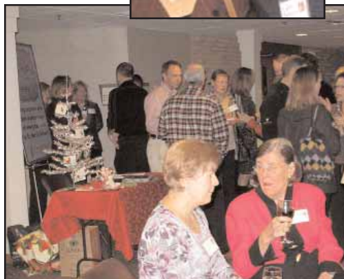
The Feast of St. Nicholas Social Event was a wonderful way to kick of the holiday season.