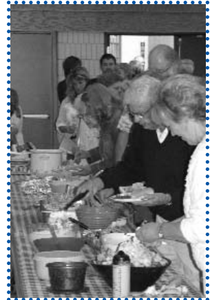
A variety of great dishes were enjoyed by all!