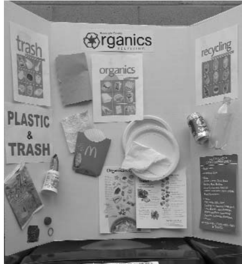
Look for the signs of St. Bart's going green.

The success of the program really depends on all of us pitching in and making sure the right materials go in the right containers. Signs and volunteers will help you determine what goes where. That little