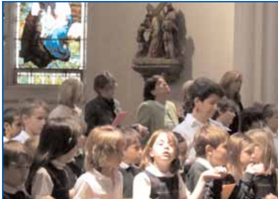
Saint Bartholomew School students participate in a Spanish Mass at Holy Rosary each spring.

To sign up for this giving option and have your donations transferred electronically to Holy Rosary, please complete an enrollment form (located at the Information Desk or on our website, under Social Concerns,