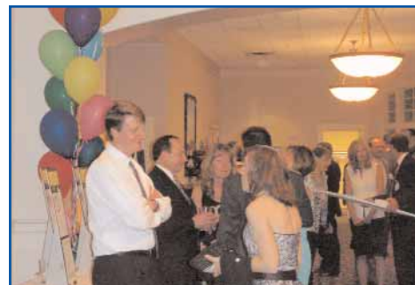
The April 17th Images of Spring event will be a great opportunity to party with the people you pray with.

This wonderful event is once again being held at the beautiful Golden Valley Country Club. Our theme for this year is "Blue Jeans & Bling!" No need to buy a new dress, unless you want to! For those parishioners who have never attended the auction,