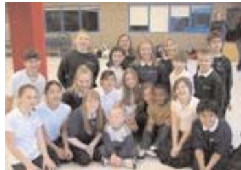
Sixth grade Life Crusaders in action at Mary’s Place/Sharing and Caring Hands.

How hard it is, in our busy lives, to take time to help others, especially when they are not people we personally know. Yet, these words of Jesus call us to do just that – to help our neighbors and to be generous with our time, gifts, and talents. During this past school year, a group of sixth graders from St. Bartholomew School answered Jesus’ call and gave of themselves, to the greater community, in some extraordinary ways.