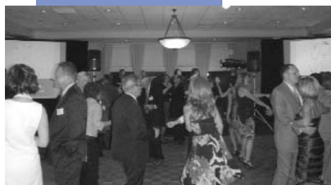
Once the auction ended the dancing began.