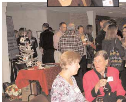
The Feast of St. Nicholas Social Event was a wonderful way to kick off the holiday season.